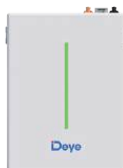
Config Version: E