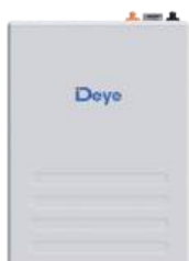
Config Version: L