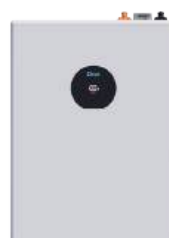
Config Version: C